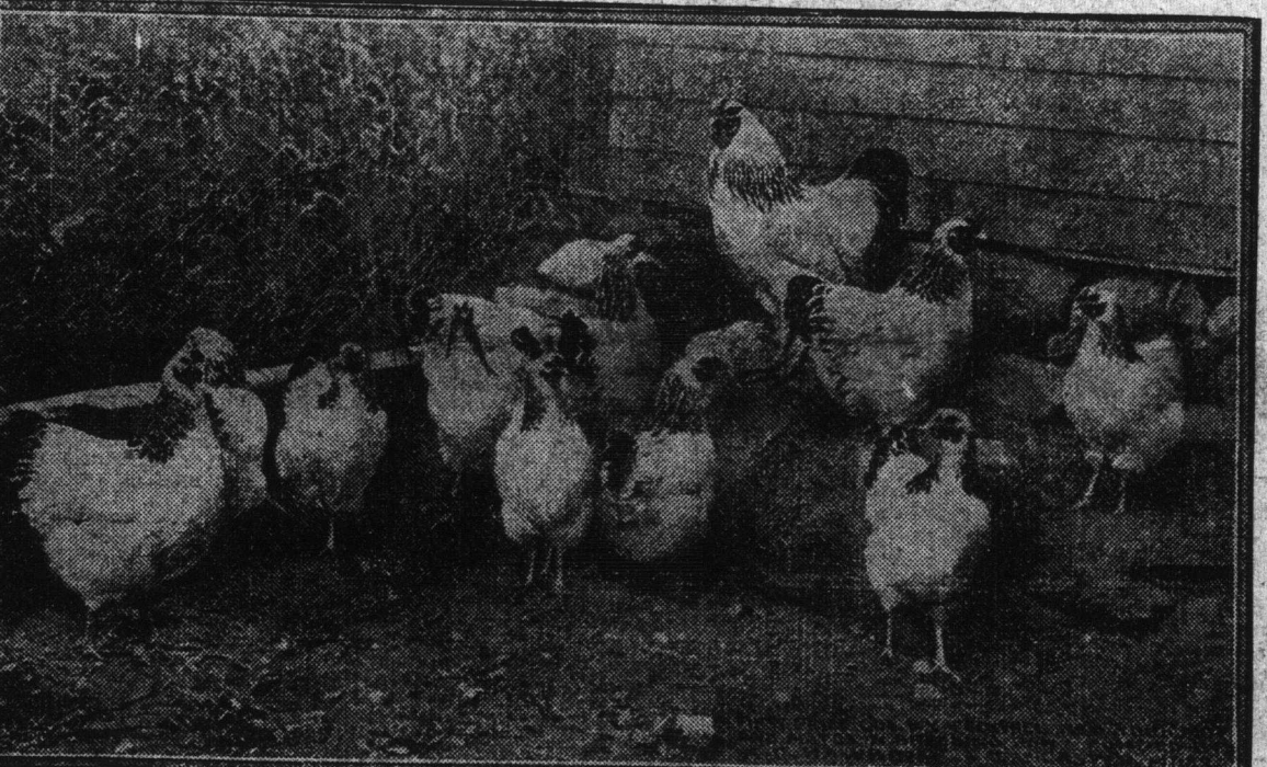
A Typical Pen of Columbian Wyandottes