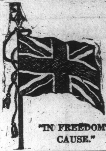
"IN FREEDOM'S CAUSE."