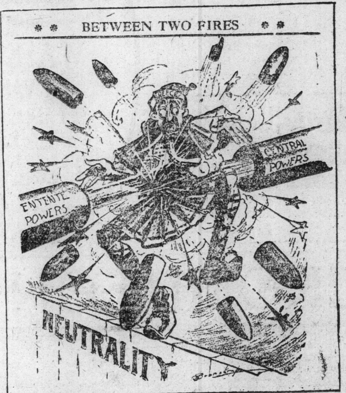
FROM THE SAN FRANCISCO CHRONICLE

The current revenue for St. John's, Nfld., is $16,000 behind what it was last year.