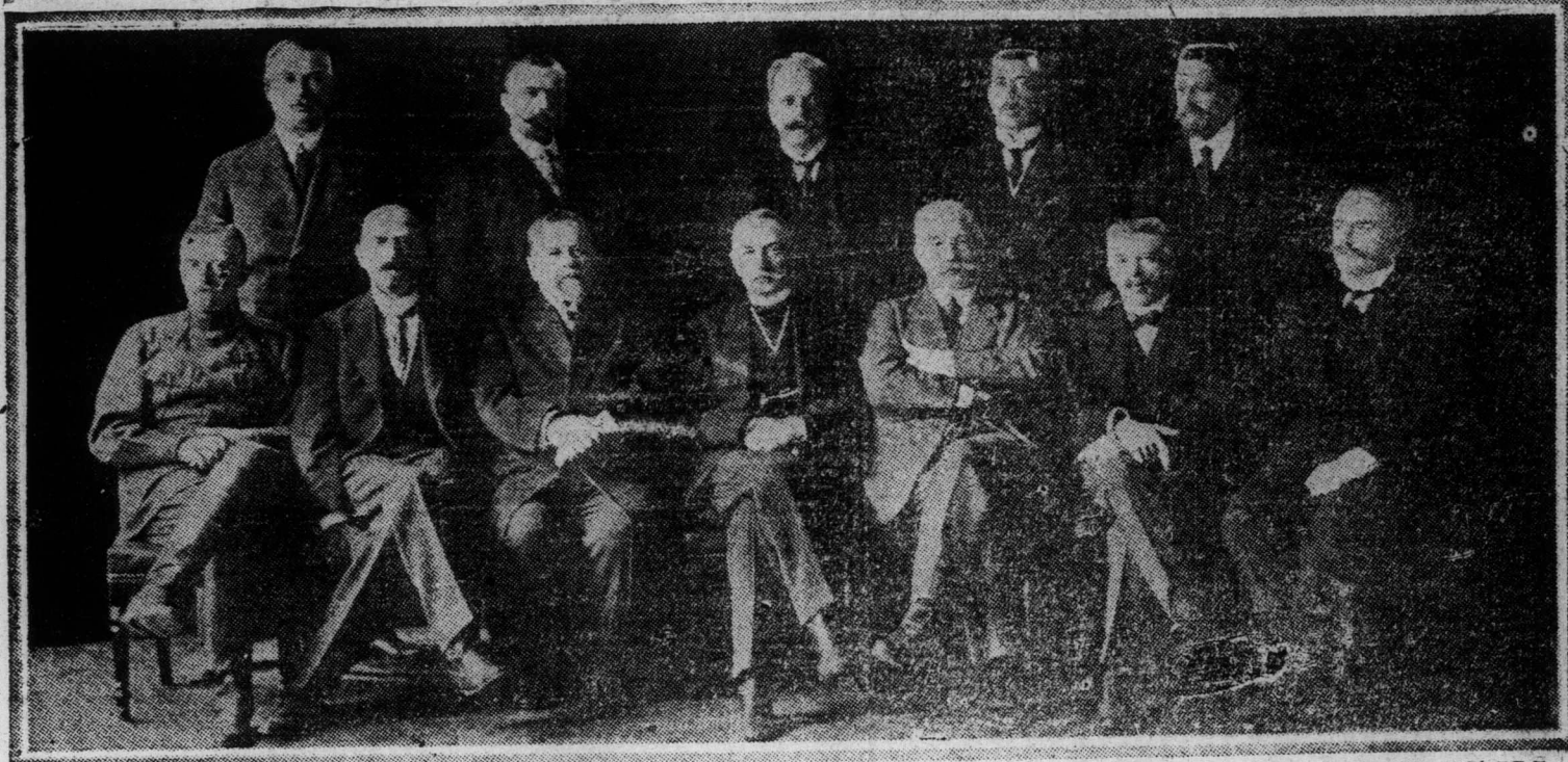
MEMBERS OF THE RUSSIAN DUMA ON A VISIT TO ENGLAND.

These members of the Russian parliamentary delegation visited England at the invitation of the British government for the purpose of promoting a closer understanding between the two countries. Included in the delegation is M. A. D. Protopopoff, the energetic vice president of the Duma. During their visit they held many important conferences with the British officials.