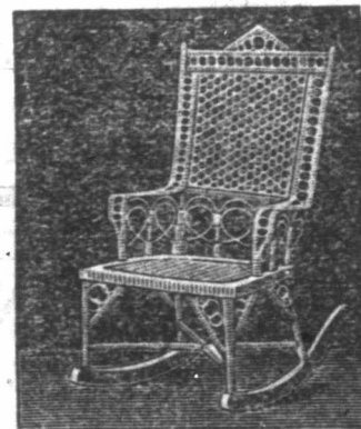
No. 315 Pembroke Square Rattan Chair.