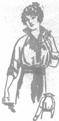
8340 Fancy Blouse, 34 to 42 bust.