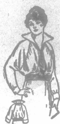
8367 Raglan Blouse, 34 to 44 bust.