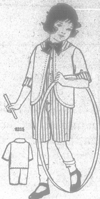
DESIGN BY MAY MANTON. 8315 Boy's Suit with Coat Effect, 4 and 6 years.