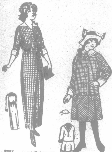
8255 Semi-Princesse Dress for Misses and Small Women, 16 and 18 years. 8376 Girl's Coat with Circular Skirt, 10 to 14 years.