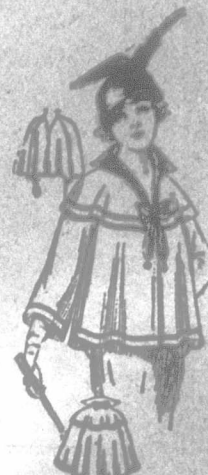
8362 Cape Coat, 34 to 42 bust.

S with the con- u shoot the lin ne ng Rifle always dependable amous for their reme accuracy. or big cata- right gun. arms Co. Haven, Conn. extra large well 100 shearing ewes lambs from my ny kind wanted. C.P.R. 3 miles G.N.R. 4 miles ambs; low ifford rkshires, we can id and up, sired by Exhibition Cham- Correspondent nglish Berkshires young boars and age. Order early on, Ont. re sows for sale and and some ready THOMAS, ONT HIRES addon Torredos, ivery guaranteed. Langford Station Two choice sows for service sows best stock on both stock bull, Broad- and a 12-year-old T. L. D. Phon sows fur s of from T. R.