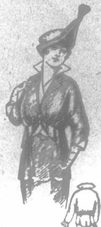
8276 Kimono Coat, 34 to 42 bust.