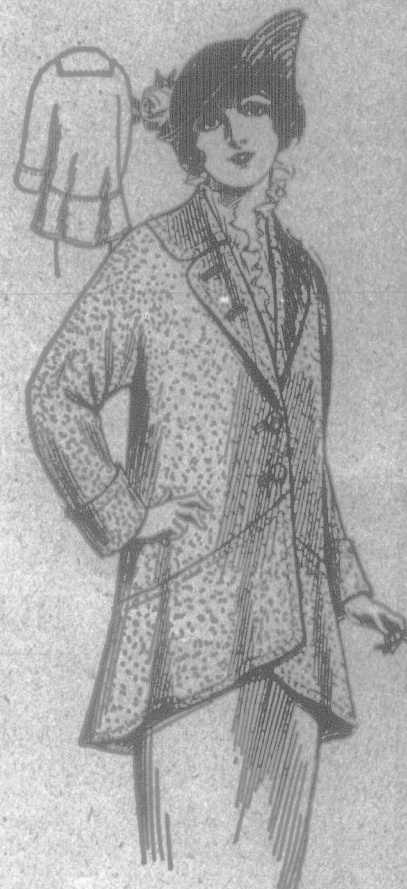
DESIGN BY MAY MANTON. 8279A Loose Coat, 34 to 42 bust.