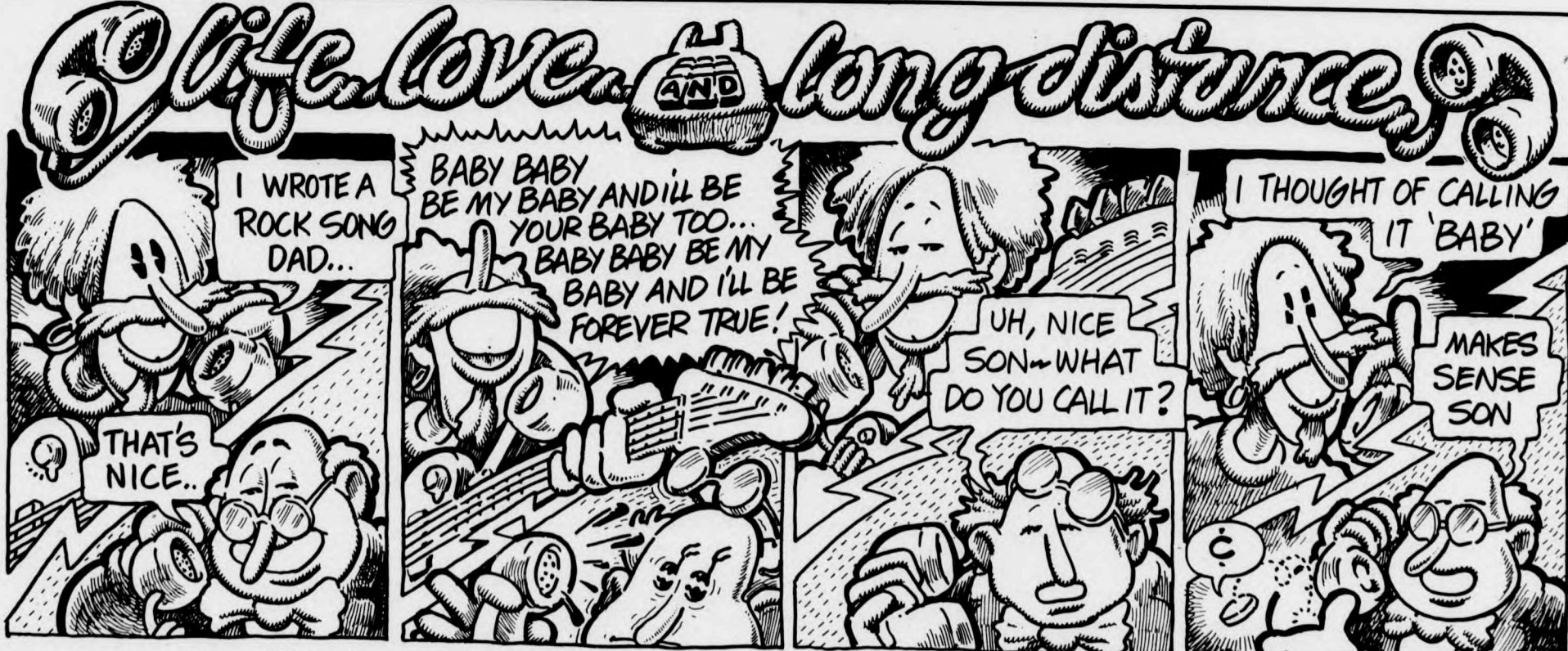
Get the feeling. The Long Distance Feeling. Trans-Canada Telephone System