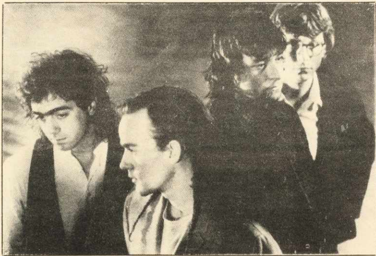
R.E.M. does the classic 'Poets-in-the-mist' pose

New Order have succumbed to a heavy bassline, Balaeric Beat, and sheep on the "Fine Time" single from their latest LP (PolyGram). The Best of The Art of Noise , featuring their remake of Prince's "Kiss" with Tom Jones on vocals, along with the new albums from Siouxsie and the Banshees and the Cocteau Twins are also available on PolyGram this month. Peepshow , the Banshees' LP, is a concept project of sorts with each track representing a situation in which some sort of invasion of privacy, observation, or onlooking is occurring. The Twins' offering, Blue Bell Knoll , is a warm bath of sound — soothing, understated guitar paired with vocals that can be aching, ethereal or bright to suit the occasion. Both are solid, recom-