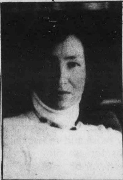
Rosalie Silberman Abella