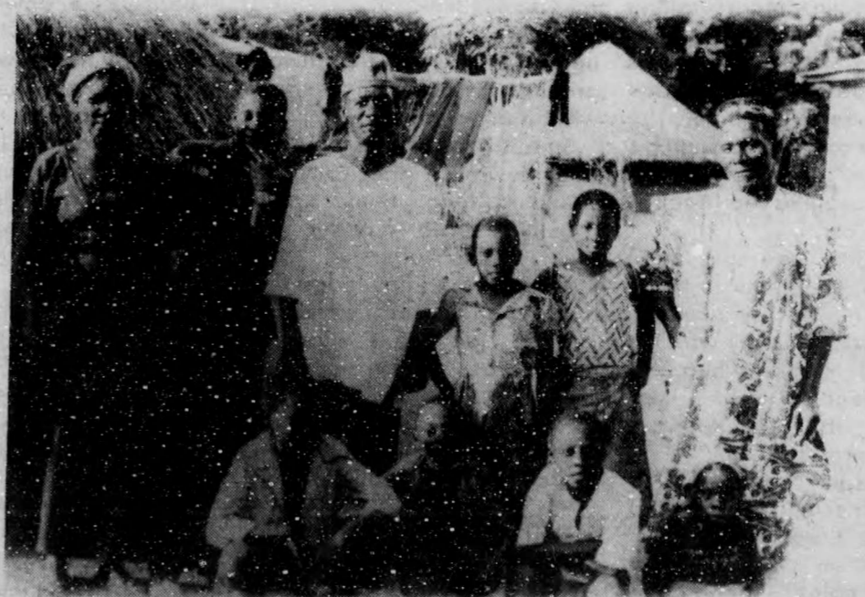
Otobi, Benue State - village people.