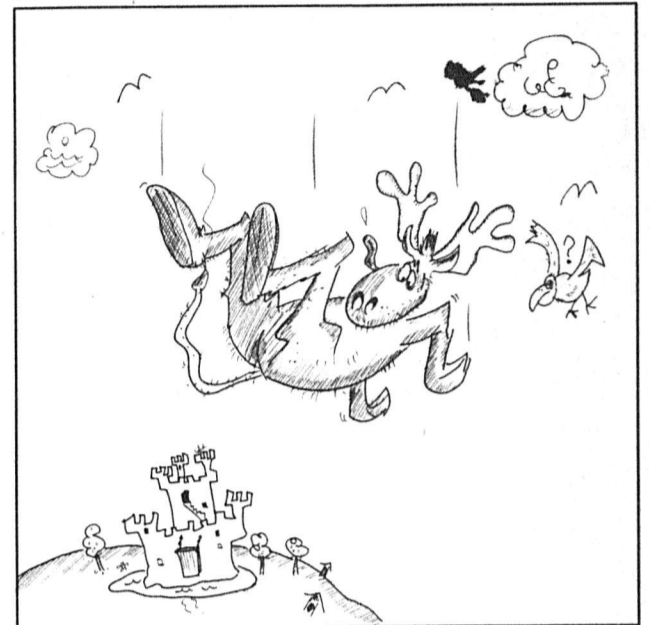
GO AND CATCH A FALLING MOOSE