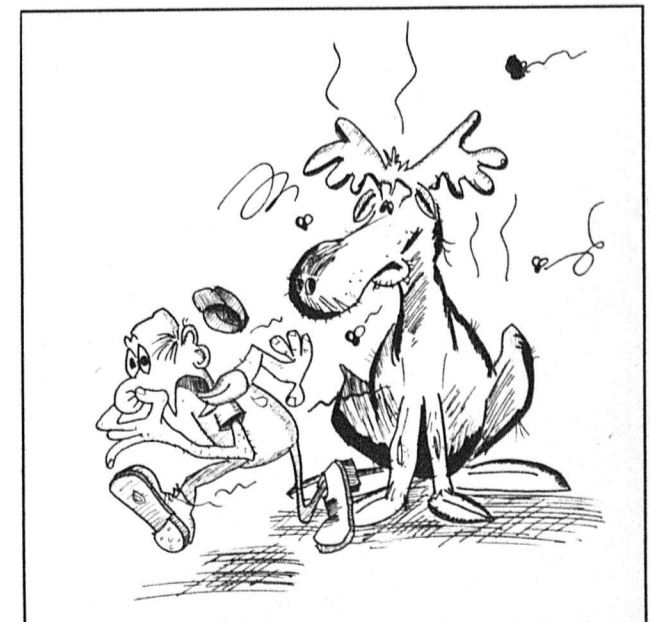
A MOOSE BY ANY OTHER NAME WOULD SMELL AS SWEET

Perhaps Queen Victoria would not, had she been aware of all implications, have stated in her most famous outbreak, We are not amosed! O tempora, o moose!