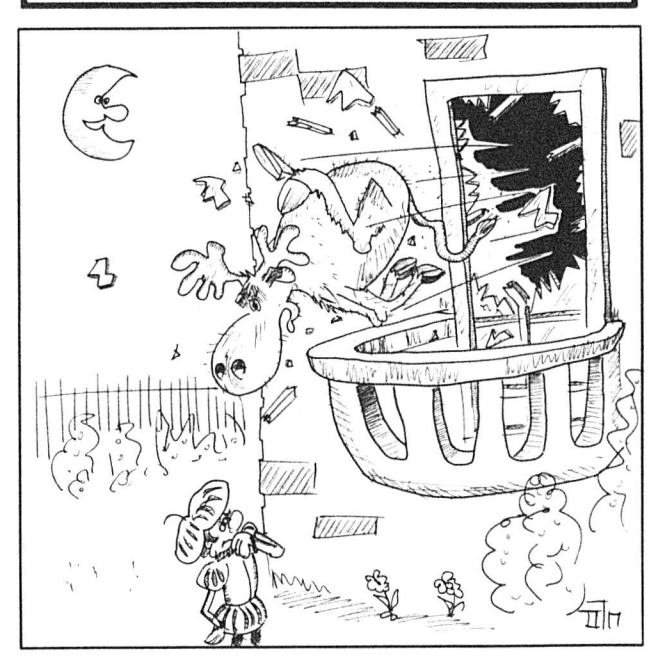
WHAT MOOSE THROUGH YONDER WINDOW BREAKS?

(See also: As You Like Moose; Henry the Fourth, Part Moose; Twelth Moose; Moosure for Moosure; Two Gentlemoose of Verona; Cymbelmoose.