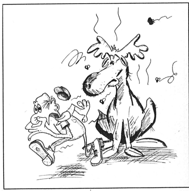
A MOOSE BY ANY OTHER NAME WOULD SMELL AS SWEET