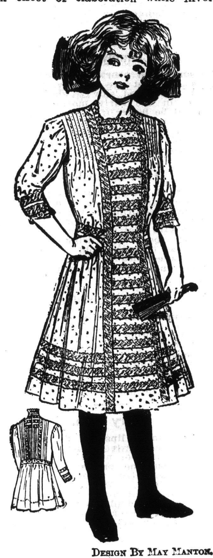
6393 Girl's Semi-l'rincesse Dress. (Sizes 8 to 14 years)

Embroidered muslin is always dainty and this frock is exceptionally attractive because of the prettily trimmed panel at the front. It gives long and unbroken lines, it suggests the princesse idea and the strips of lace mean an effect of elaboration while involv-