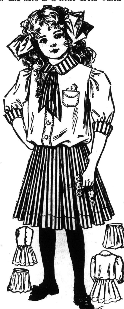
DESIGN BY MAY MANTON. 5705 Girl's Biouse Costume with Bloomers. (Sizes 6 to 12 years). No. 5705.

Combinations of plain with striped material are exceedingly smart just now and here is a little dress which is