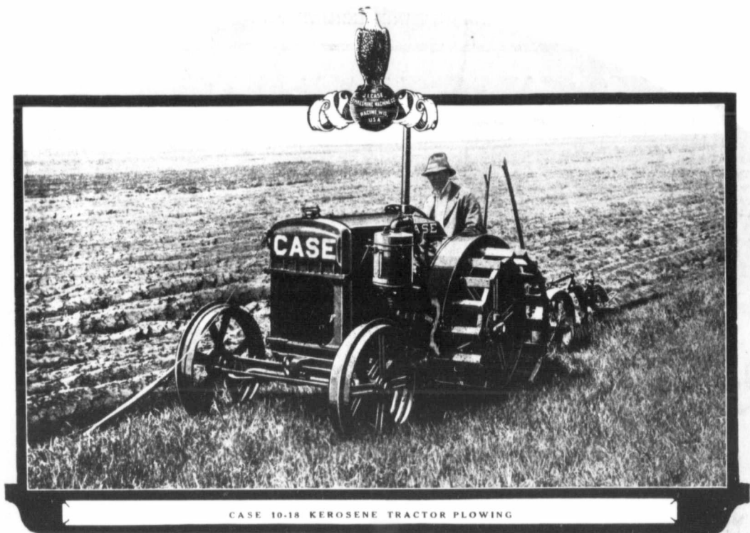
CASE 10-18 KEROSENE TRACTOR PLOWING